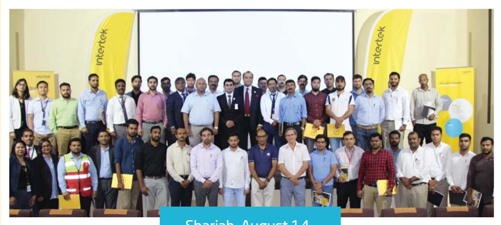
Sharjah, August 14

Within just a span of six months upon the ISO 45001 standard publication, Intertek Business Assurance Gulf has completed five seminar series in Saudi Arabia, Bahrain and United Arab Emirates. The seminars were attended by over two hundred delegates coming from various industries in the region.