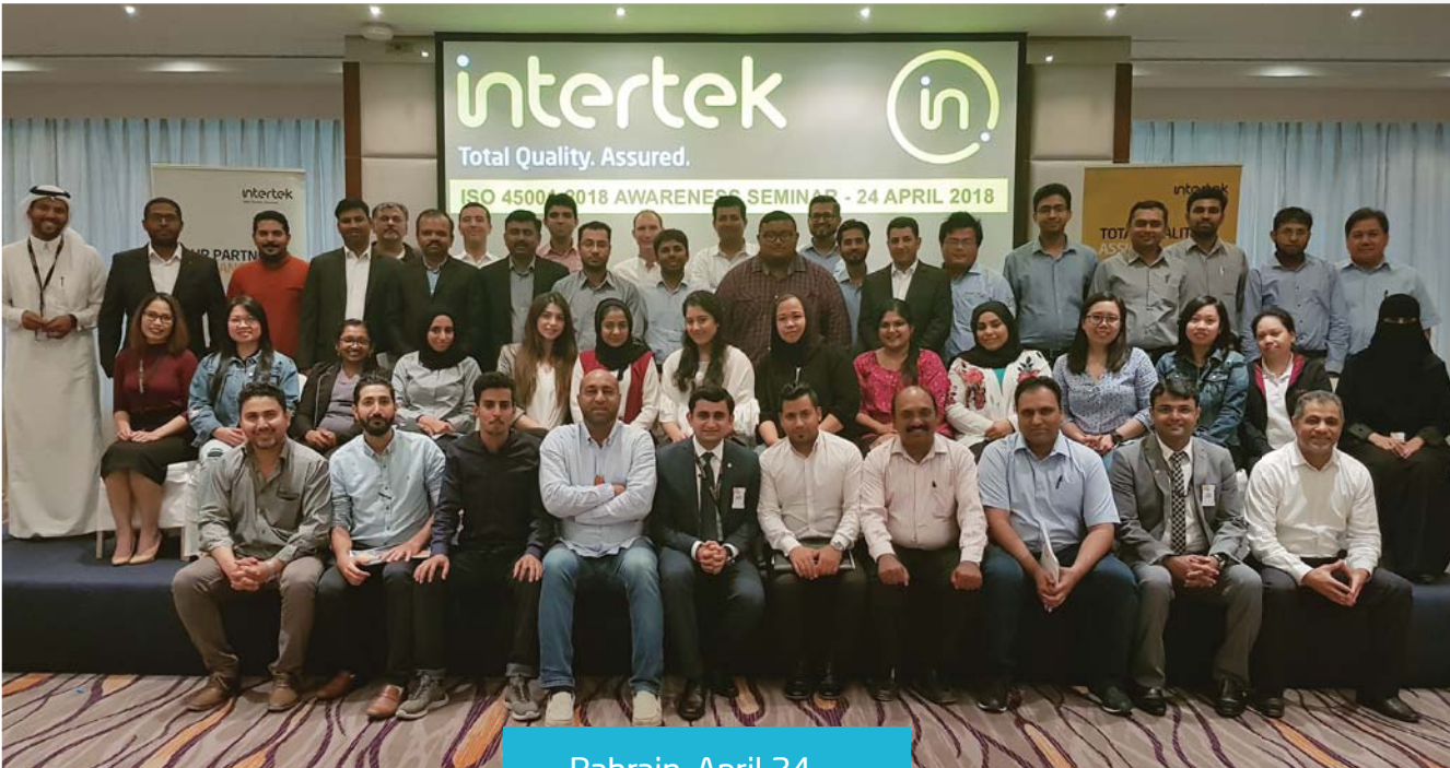
Bahrain, April 24