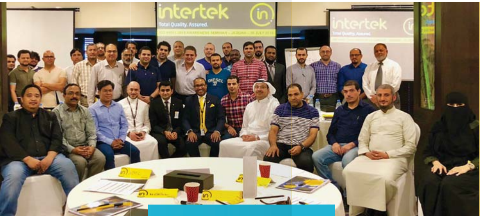
Jeddah, July 18

Click here to read our official press release.